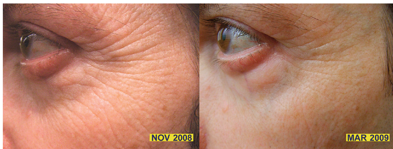
Figure 3. Representative photographs show wrinkles subsequent to 2 months of extreme oxidative stress (left) and after 3 months of daily LED treatment (right): initially 2 months of LED only, followed by 1 month of green tea assisted LED. The change resulting from 1 month of combinational treatment (less pronounced wrinkle levels, shorter wrinkle valleys, and juvenile complexion) was previously realized in 10 consecutive months. 28

ROS (Figure 1), but apparently also by the visible part of the spectrum. In vitro studies indicated a dependence of the ROS effect on three light parameters: wavelength, intensity, and dose. As a general tendency, smaller doses generated ROS levels that were beneficial for cellular processes, whereas higher doses generated levels with potentials reaching from the inhibition of cellular functions to bactericidal effects. 25 To compensate for a possibly extensive ROS generation by the intense LED light and subsequent inhibition of cellular processes, we included into our facial rejuvenation program a powerful ROS scavenger: epigallocatechin gallate (EGCG) extracted from green tea. 26 Orally administered EGCG is known to compensate for environment-induced oxidative stress. 27 Topical effects are ROS compensation and extension of the survival rate of the cells involved in the incorporation and transport of extracellular metabolic waste from the basal membrane across the epidermis to the top skin layer.